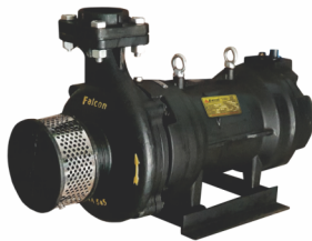
CI HMA DLX