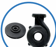
CED Coated CI Parts