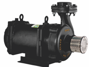
CI HMA PRM