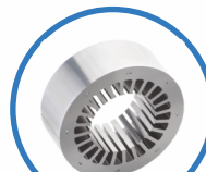
CRNGO Progressive Cutting Stamping Stack