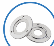
SS Oil Seal Plate