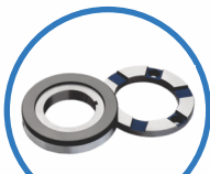
High Tech Carbon with SS Thrust Bearing

(Above Vertical Openwell can Function Horizontally Also)