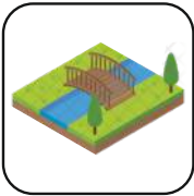
Mass Water Transfer