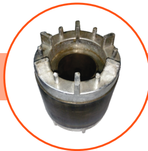
Aluminum Die Cast Rotor Stack