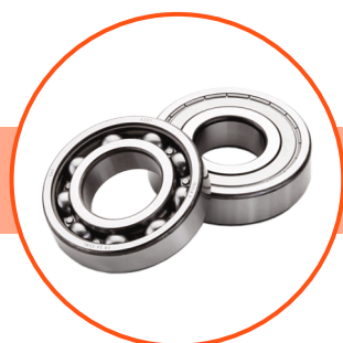
Double ZZ SKF Bearing