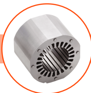
CRNGO Progressive Cutting Stamping Stack