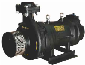
CI HMA DLX