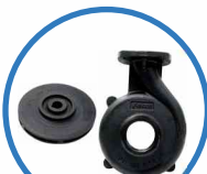
CED Coated CI Parts