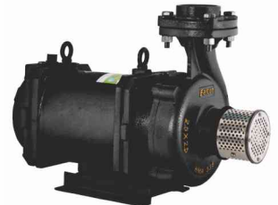
CI HMA PRM