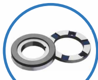
High Tech Carbon with SS Thrust Bearing

(Above Vertical Openwell can Function Horizontally Also)