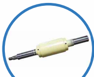
Copper Rotor with Epoxy Coating