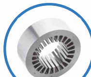
CRNGO Progressive Cutting Stamping Stack