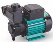
NANO - 40 B NANO - 45