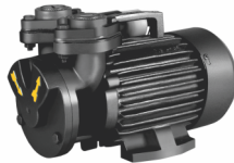
NANO - 100 V-Type