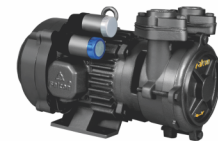
MASTERBLASTER - 50/100 SUPREME