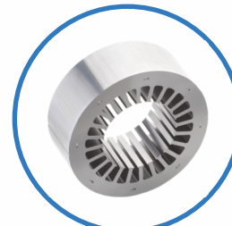
CRNGO Progressive Cutting Stamping Stack