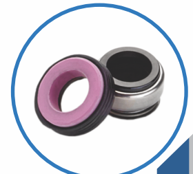
High Tech Mechanical Seal