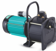
KNIGHTRIDER - 50/100/140 SUPREME