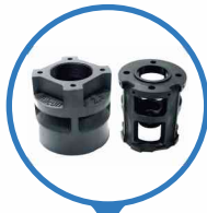
CED Coated CI Parts