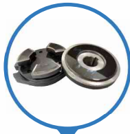
Tilting Hightech Carbon Thrust Bearing Set