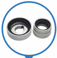
SS Sand Guard Assembly