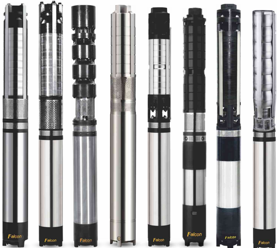
V-6 Slim SRS

Agriculture V6 Slim SRS, V6 HRS, NRS, HRC, URC & FMC CI & SS Fully Borewell Submersible Pumpsets