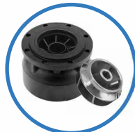
CED Coated Mix Flow Bowl Set