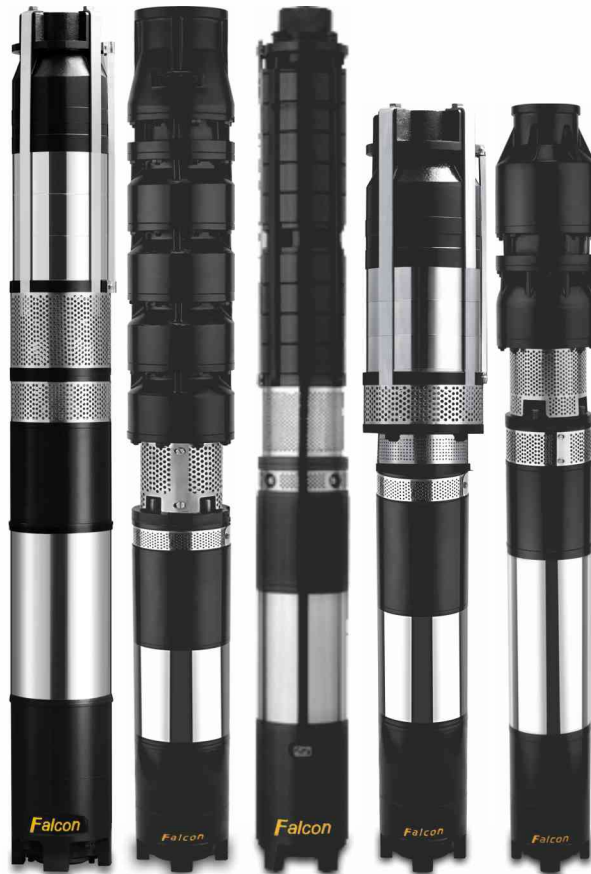
V8/V10 HRS V8/V10 FMC/HFQ V8 URC V8/V10 JANTA HRS V7/V6 JANTA FMQ

Agriculture V7 FMQ / V8 HFQ/FMC/URC/HRS Series Borewell Submersible Pumpsets