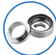
Sand Guard Assembly