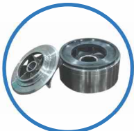
Redial SS Bowlset With Rubber Plate